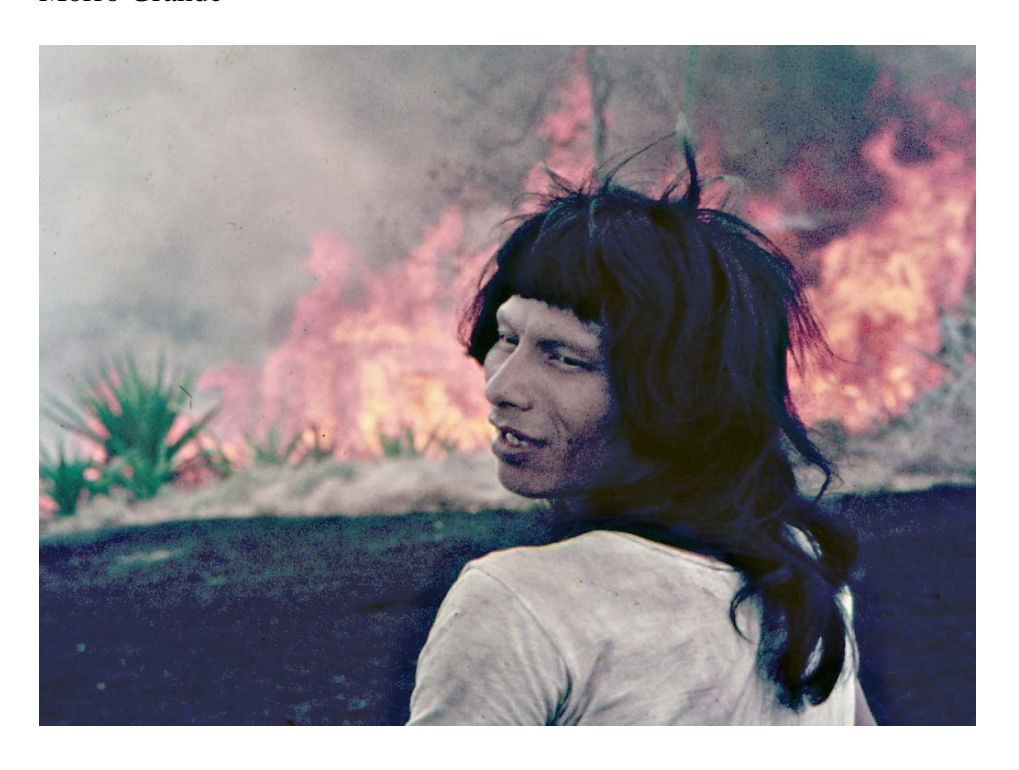
MIND ON FIRE