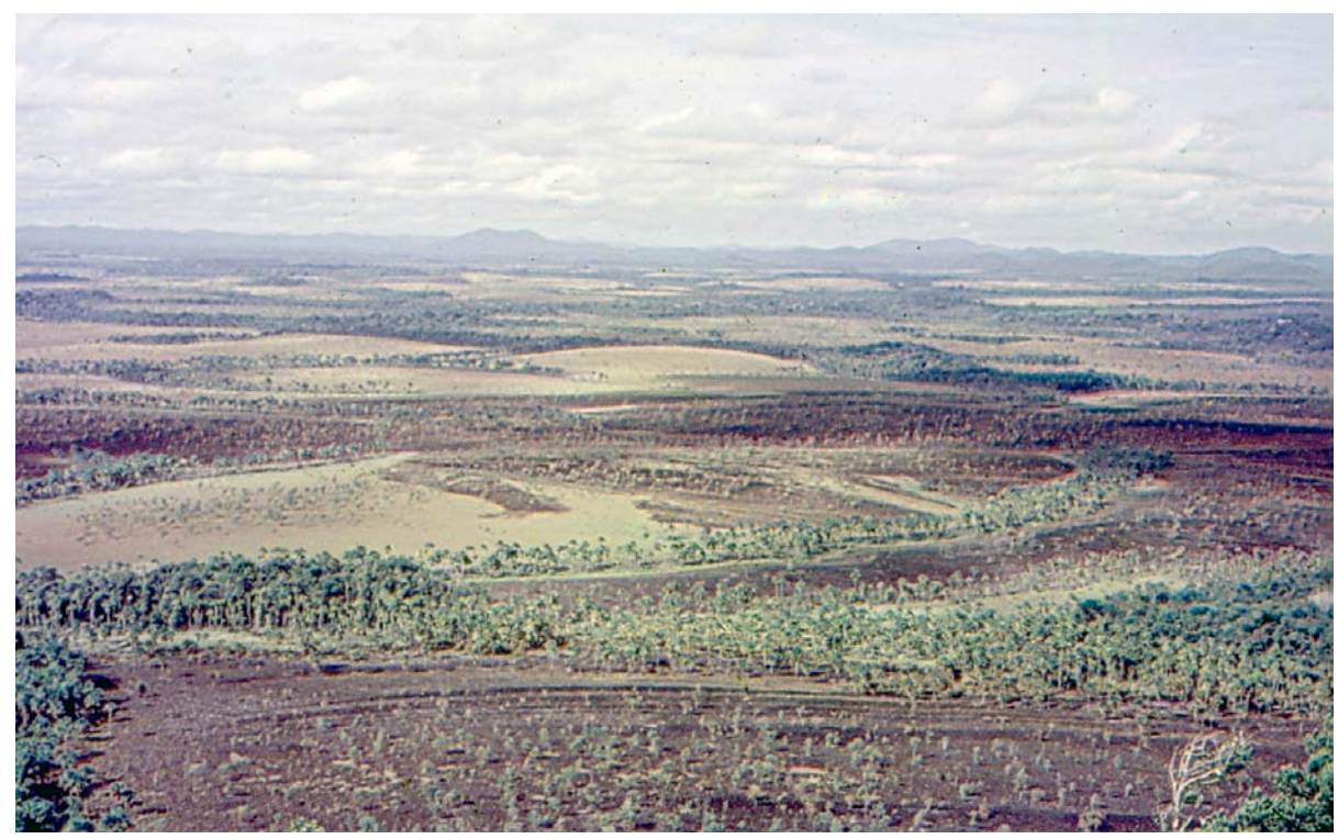
Traces of a recent fire, probably stopped by sudden rainfall, as seen from the top of the Morro Grande