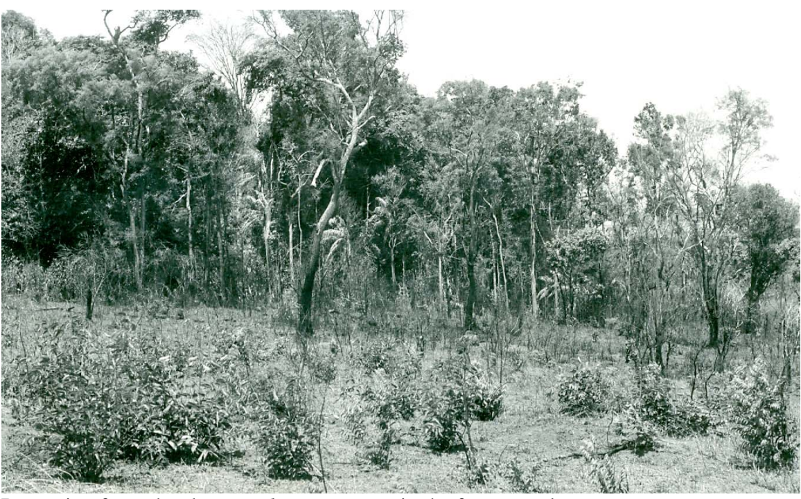
Retreating forest border, Dioclea guianensis in the foreground.