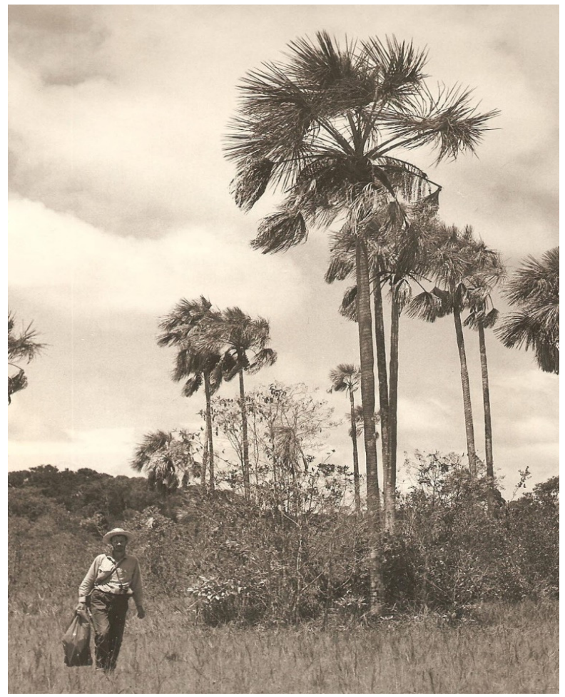
Feddo Oldenburger collecting a Mauritiella seedling.

After a botanical survey, mapping the vegetation of the southern part of the large Sipaliwini Savanna, Schulz, Oldenburger and Tawjoeran visited, on their last day before leaving the Sipaliwini area, a small white-sand savanna to the south of the Sip. Airstrip (same location as Van Donselaar visited earlier). During a relaxed stroll they found plenty traces of recent fires including parched shrubs and savanna bushes. A ground layer of dried up lichens (Cladonia spec.) may have intensified such fires, they thought. Find of the day was a small cluster of slender white-trunked palms with a distinctive thorny bark, a new species for Surinam, in the Guianas only known for the Kaieteur waterfall region.